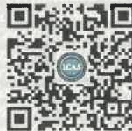
Focus on icas WeChat platform

Certification and Accreditation Administration of PRC:CNCA-R-2003-117 Tel: 400-633-9001 / +86 021-51114700 Web: www.icasiso.com Add: Room 801,HuaDing Mansion, 2368# West Zhongshan Rd., Xuhui District, Shanghai, China, 200235