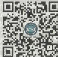
Focus on icas WeChat platform

Add: Room 801,HuaDing Mansion, 2368# West Zhongshan Rd., Xuhui District, Shanghai, China, 200235